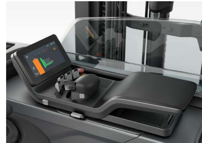
The adjustable mini-joystick console allows for accurate fingertip control.