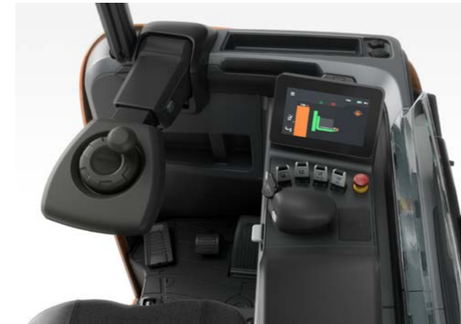
The operator compartment offers many different storage as well as dedicated space for PC with power outlet and a USB connector.