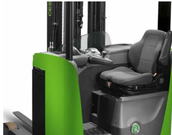
Cab designed around the driver (shows optional 'comfort' seat).