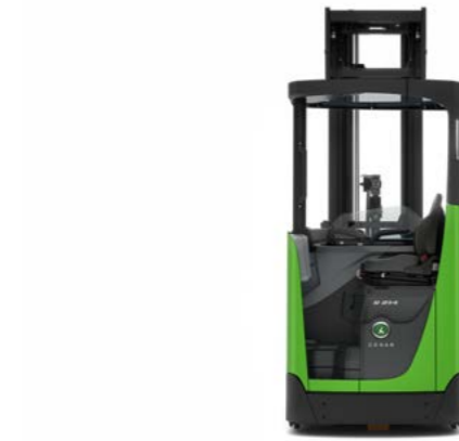
The CESAB R200 is perfect for block stacking, working narrow areas and drive-in racking.