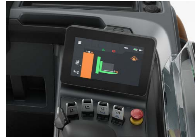
Easy-to-read colour touchscreen display offering intuitive and interactive functions.