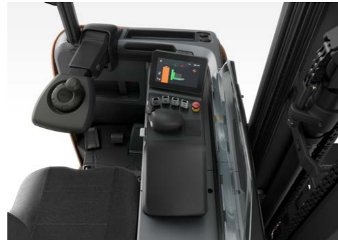
The cabin is ergonomically designed around the operator offering a comfortable workstation with all controls within reach.