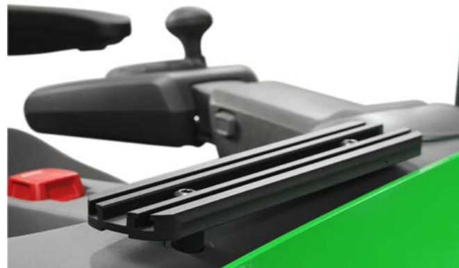
Optional E-bar mount for all ancillary equipment.