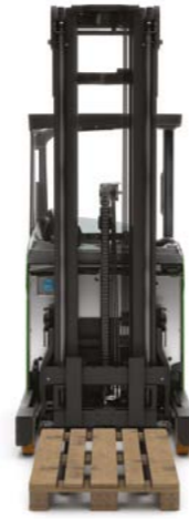
The narrow chassis of the CESAB R200 makes handling EUR pallet between support arms easy.