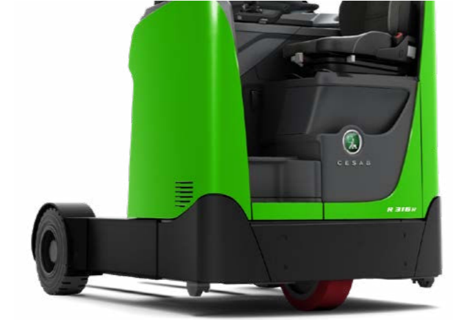
The CESAB R300 Outdoor can handle road gradient and transition lines thanks to soft and elastic tyres, a durable drive wheel made from Redthane, and 145 mm ground clearance.