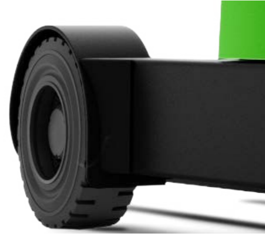
The tyres on the R300 Outdoor can handle most indoor and outdoor surfaces but consider some limitations on snow and ice.