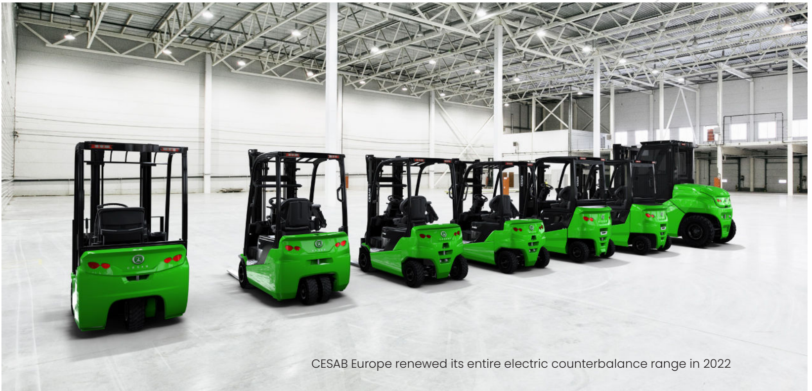
CESAB Europe renewed its entire electric counterbalance range in 2022