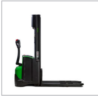
CESAB S210-214, S208L-214L, S220D