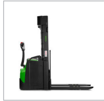
CESAB S215-220, S215L-220L